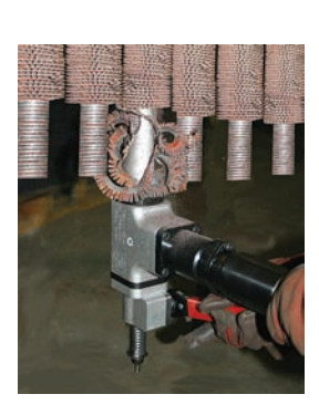
The tube is ready for end prepping after the fin is removed.