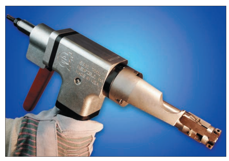
This hand-held fin removal tool features a cutter head that efficiently cuts the bond between the fin and the tube O.D.

"Fin" MILLHOG® Working Range 1-1/4" (31.8 mm) I.D. to 3" (76.2 mm) O.D Motor, pneumatic 1-1/4" h.p. (.932 kW) Air Pressure 90 psi (6.2 bar) Air Volume 40 cfm (1133 lpm) 180 rpm Speed Minimum Clearance 2-5/8" (66.68 mm) Head Length 19" (483 mm) Working Weight 24 lbs (10.9 kg) Shipping Weight 63 lbs (28.6 kg) Shipping Dimensions 24" x 20" x 7" (610 mm x 508 mm x 178 mm) Manufacturer reserves the right to change specifications without notice.